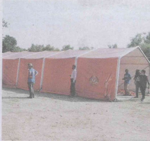
The Malaysian government's field hospital being set up in Ukhiya, near the Kutupalong and Balukhali refugee camps in Cox's Bazar, Bangladesh.