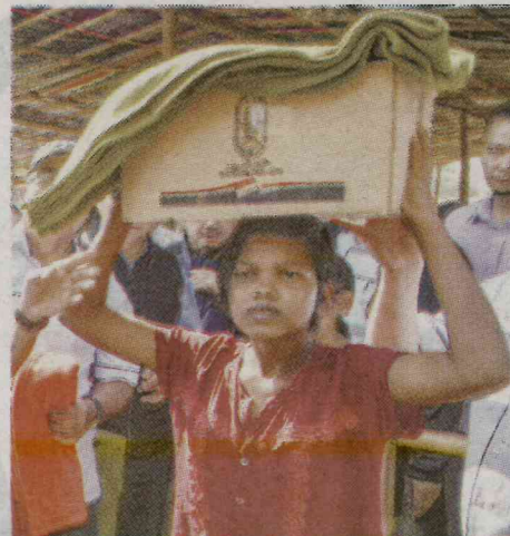
A refugee with some essential items.

"That way the medical service offered to