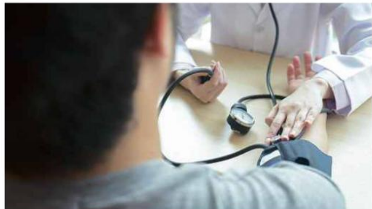
Diabetes and hypertension are the main causes of kidney failure.