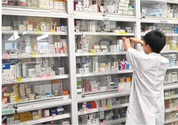
Stock take: A pharmacist arranging medicines at a pharmacy in Petaling Jaya.