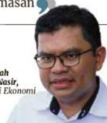
Akmal Nasrullah Mohd Nasir, Menteri Ekonomi

Kerajaan turut pantau stok ubat secara berpusat, pelbagaikan sumber import, mengaktifkan pelan gerak balas kecemasan