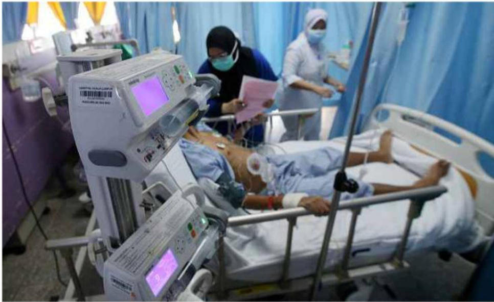
PENDIGITALAN sepenuhnya mampu hapus budaya 'berperang' dengan birokrasi dan timbunan kertas kerja yang membebankan di semua fasiliti kesihatan awam.

"Kami sedang memperbaiki sistem ini supaya lebih prihatin, mengangkat digniti dan memulihkan