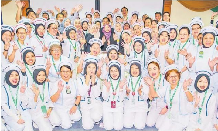
Members of the nursing team and guests pose for a group photo during the International Nurses Day 2026 celebration.

Nadzrah said the centre's continuous efforts in post-basic training, clinical competency development, implementation of the Early Warning Score (EWS), patient safety programmes and accreditation preparations were important investments in strengthening the nursing