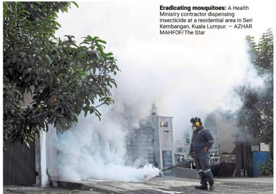
Eradicating mosquitoes: A Health Ministry contractor dispensing insecticide at a residential area in Seri Kembangan, Kuala Lumpur.

may store water in containers, drums and buckets. Without proper care and attention, these stored water containers can become ideal breeding sites for mosquitoes.