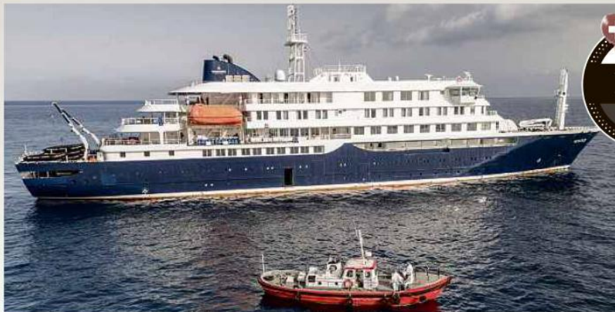
An ambulance boat carrying crew members in hazmat suits approaching the cruise ship MV 'Hondius' near the port of Praia in the capital of Cape Verde recently.

The virus is named after the Hantan River in South Korea, where more than 3,000 troops fell seriously ill after becoming infected during the 1950-1953 Korean War.