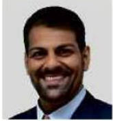
Timbalan Dekan Akademik & Pengantarabangsaan, Kulliyah Kejururawatan, Universiti Islam Antarabangsa Malaysia (UIAM)

• Pendekatan jangka pendek seperti menurunkan syarat kemasukan ke program kejururawatan bukanlah langkah yang bijak. Kualiti tidak boleh dikompromi demi kuantiti