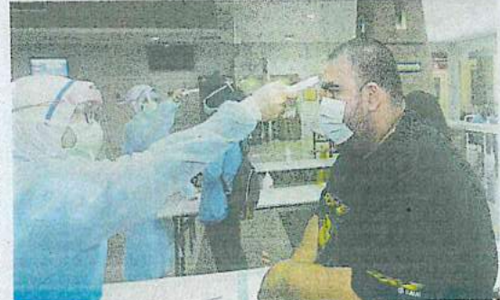
A nurse checking the temperature of a visitor at Putrajaya Hospital.