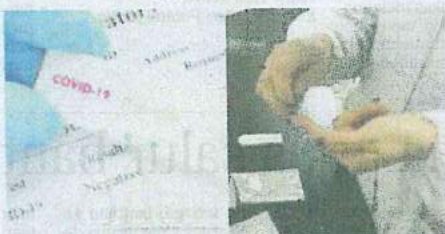
Ujian melalui teknik rapid test kit bertujuan mengesan antibodi yang terhasil di dalam badan. (Foto hiasan)

kan akan mengesan kehadiran virus COVID-19 di dalam badan pesakit.