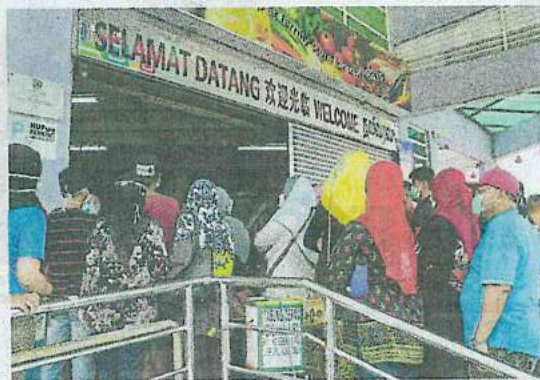
Orang ramai perlu mematuhi penjarakan sosial supaya terhindar daripada risiko dijangkiti COVID-19.

Dalam perkembangan lain, beliau berkata temujanji warga emas menjalani rawatan susulan penyakit kronik tetapi dalam keadaan stabil dan bayi untuk suntikan vaksin, boleh dipinda bagi mengurangkan risiko jangkitan