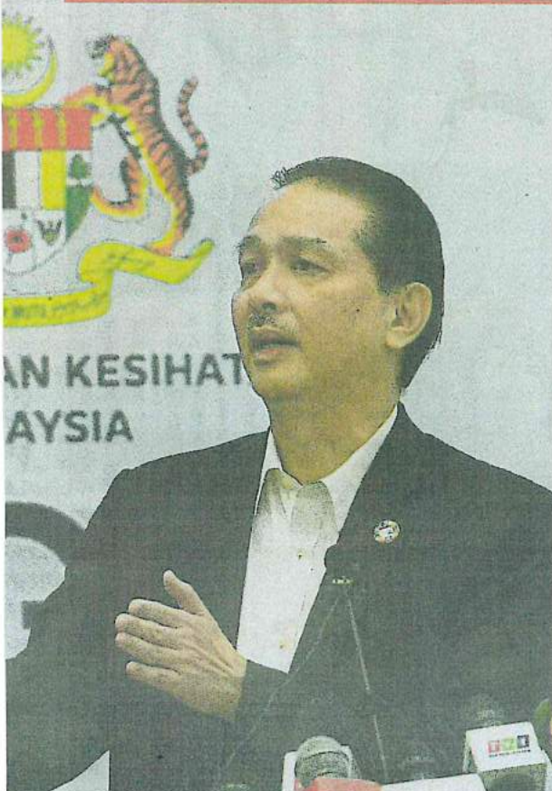
Health director-general Datuk Dr Noor Hisham Abdullah at a press conference on the Covid-19 daily update in Putrajaya yesterday.