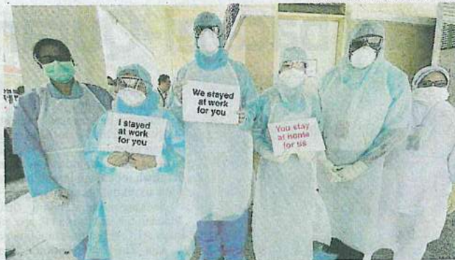
Contoh pemakaian PPE sebenar oleh petugas kesihatan di Pejabat Kesihatan Daerah (PKD) Hillir Perak.