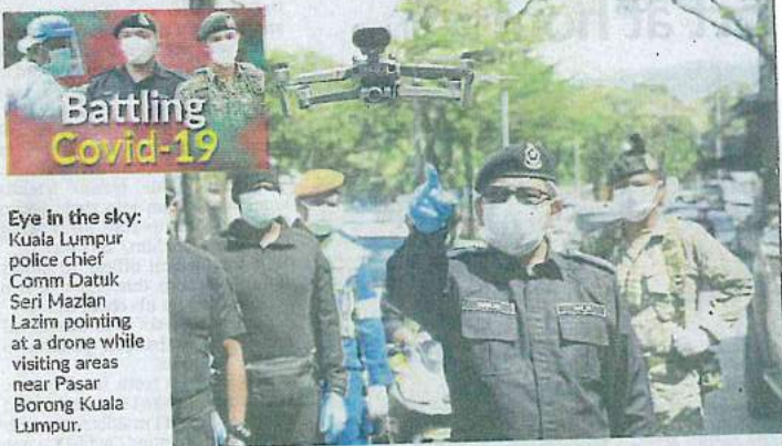
Battling Covid-19 Eye in the sky: Kuala Lumpur police chief Comm Datuk Seri Mazlan Lazim pointing at a drone while visiting areas near Pasar Borong Kuala Lumpur.

For details, visit starfoundation.com.my