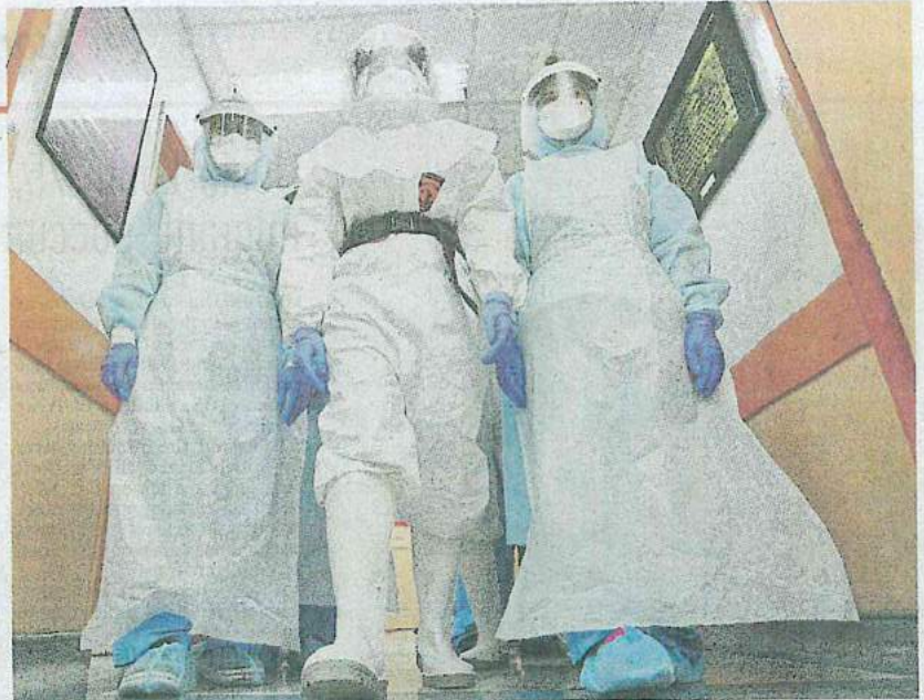
Medical staff in personal protective equipment making their rounds at Kuala Lumpur Hospital yesterday.

Some related how they have left their families and dependents behind to do their job, while others described being lied to by patients who have had close contact with Covid-19-positive patients.