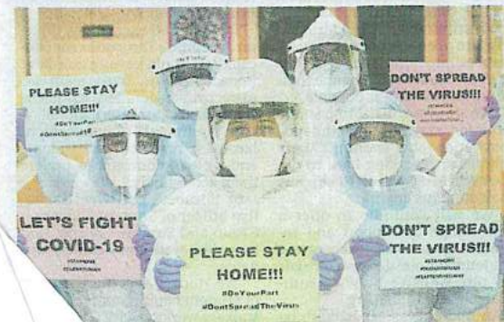
Frontliners at Kuala Lumpur Hospital appealing to the people to curb the spread of Covid-19.

"As the number of patients rises, you can only imagine how exhausted the healthcare workforce will be."