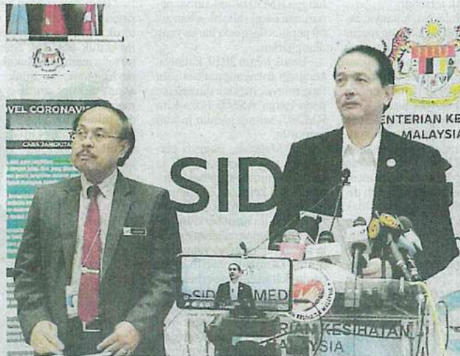
Dr Noor Hisham (kanan) pada sidang media harian berkenaan Covid-19 di Kementerian Kesihatan di Putrajaya semalam.

"Berdasarkan siasatan, daripada jumlah itu, 43 kes berkaitan dengan kluster tabligh manakala Kementerian sedang mengenal pasti punca kluster kepada 63 yang lain," katanya.