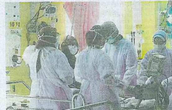
A team of medical staff examining a patient under investigation at Putrajaya Hospital.

pray that things will get better and we can fight this together.