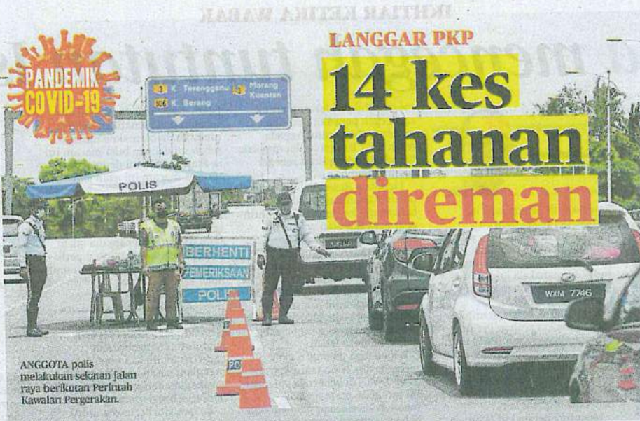
ANGGOTA polis melakukan sekatan jalan raya berikutan Perintah Kawalan Pergerakan.

Kedua-dua tertuduh masing-masing didenda RM5,000 atau masing-masing 12 dan 10 bulan penjara jika gagal membayar denda. Sementara itu, Mahka-