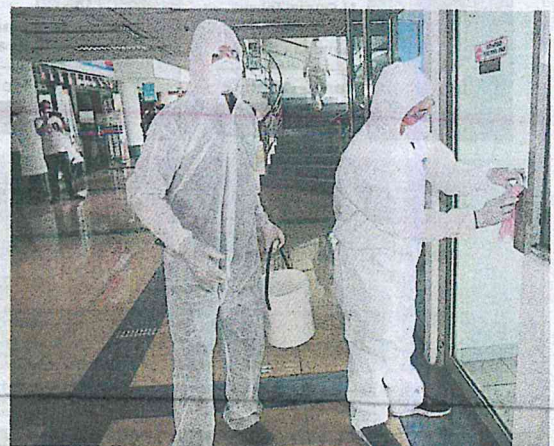
Pengurusan FELCRA Berhad melaksanakan operasi pembersihan sanitasi secara menyeluruh membabitkan enam tingkat di Wisma FELCRA bagi menangani penularan jangkitan COVID-19.