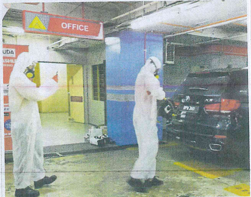
Health officers disinfecting a vehicle at Uda Holdings Bhd's building in Kuala Lumpur yesterday, following reports of a board member contracting the Covid-19 virus.

The public can get information on Covid-19 by contacting the National Crisis Preparedness and Response Centre's hotlines at 03-88810200, 03-88810600 or 03-88810700.