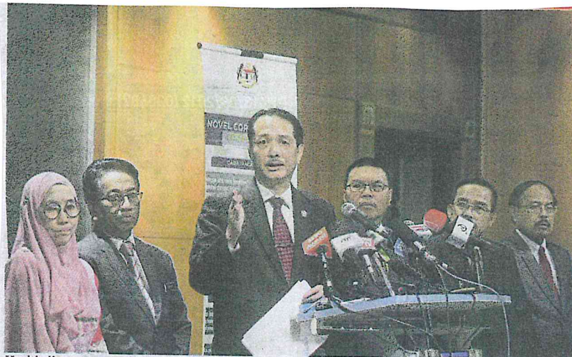
Health director-general Datuk Dr Noor Hisham Abdullah (third from left) speaking at a press conference in Putrajaya yesterday.

AKHBAR : NEW STRAITS TIMES MUKA SURAT : 2 RUANGAN : NEWS/STORY OF THE DAY