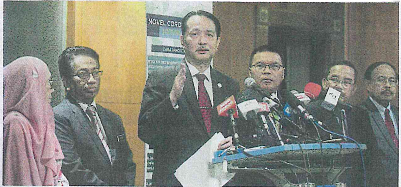
Dr Noor Hisham pada sidang media selepas Mesyuarat Jawatankuasa Kerja Kluster Penyakit COVID-19, di Putrajaya, semalam.

"Di dalam tempoh ini juga, semua peserta, kontraktor dan pembekal boleh berurusan seperti biasa dengan mana-mana bahagian di ibu pejabat menggunakan kemudahan komunikasi sedia ada," katanya.