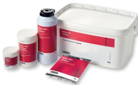
Figure 1: Rely+On Virkon products

Non-toxic and biodegradable, Rely+On Virkon is available in tablet, powder and solution. It is readily soluble in warm tap water and remains stable for up to five days as a 1:100 solution. 2