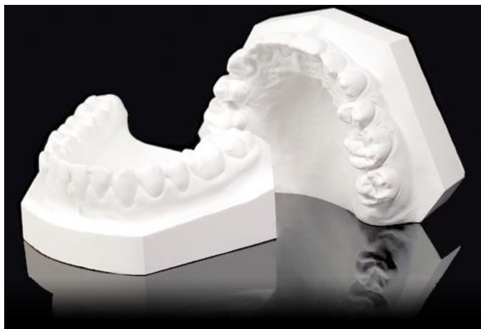
Figure 1: Dental plaster model

Until lately, plaster models have been the only way to make 3D models to accurately represent a malocclusion.